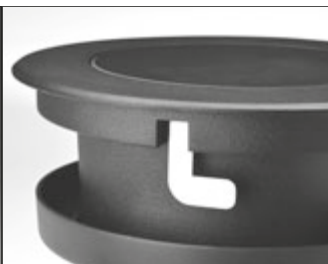
SLIDING HOOKING SYSTEM FOR RECESSING BOX